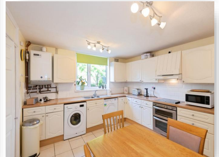
Grove Close, WATCHET, TA23 0HN