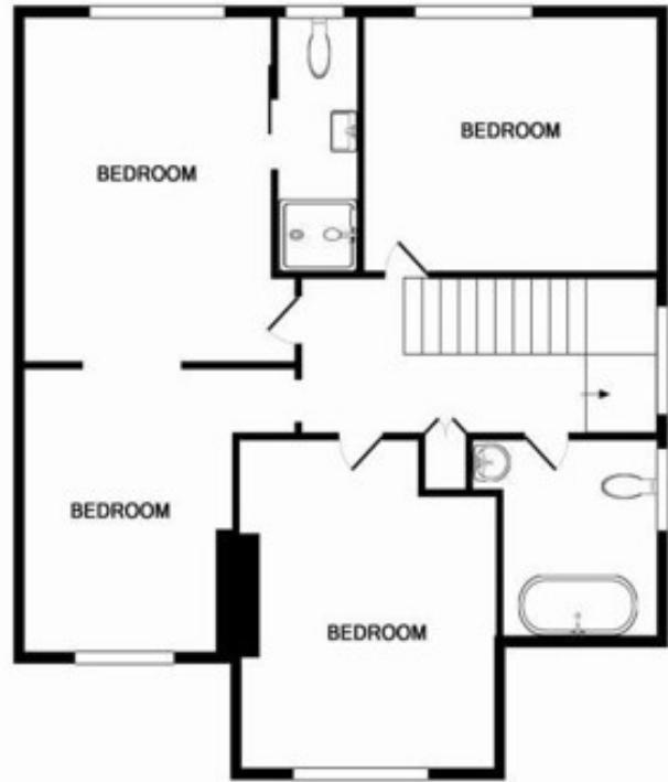
1ST FLOOR APPROX. FLOOR AREA 787 SQ.FT. (73.1 SQ.M.)