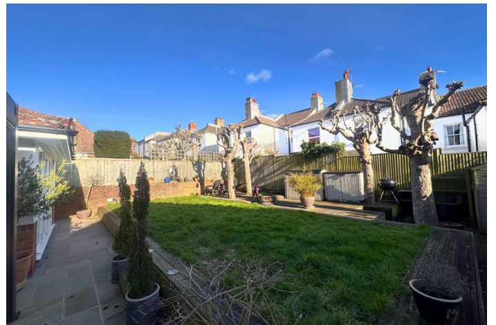
House - Detached (EPC Rating: B)