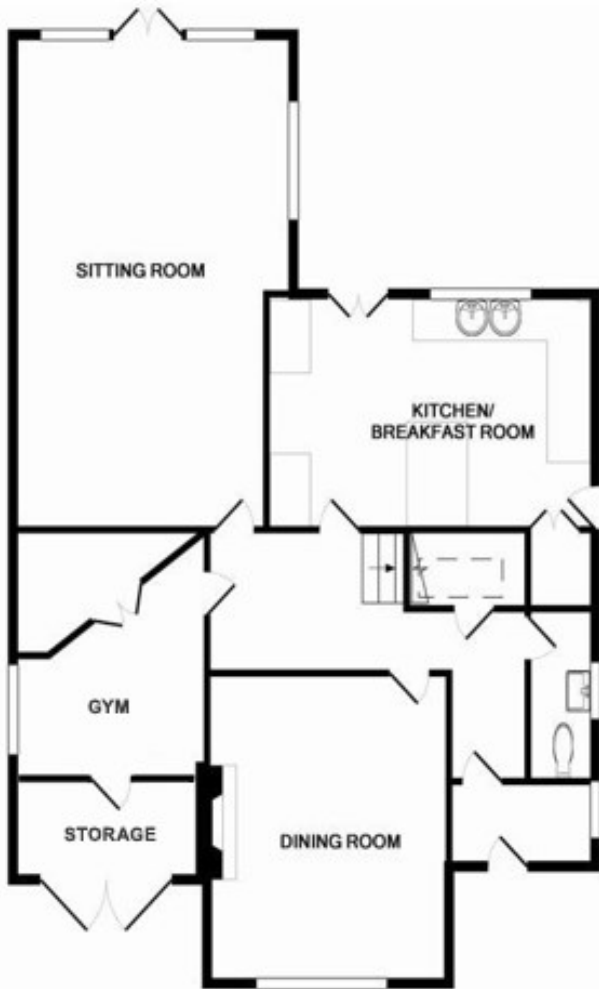
GROUND FLOOR APPROX. FLOOR AREA 953 SQ.FT. (88.6 SQ.M.)