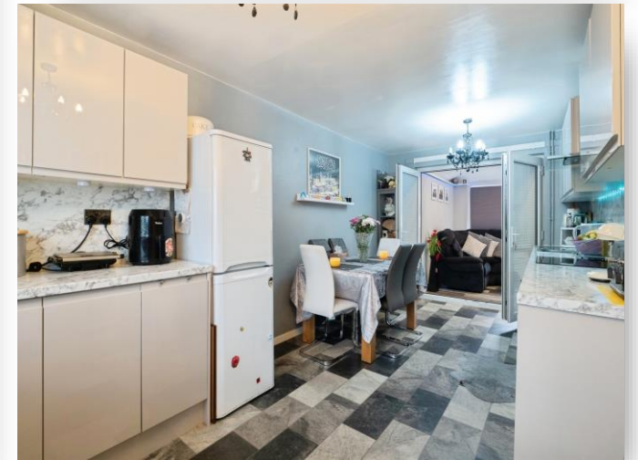
Bedale Drive, Leicester LE4 2LA