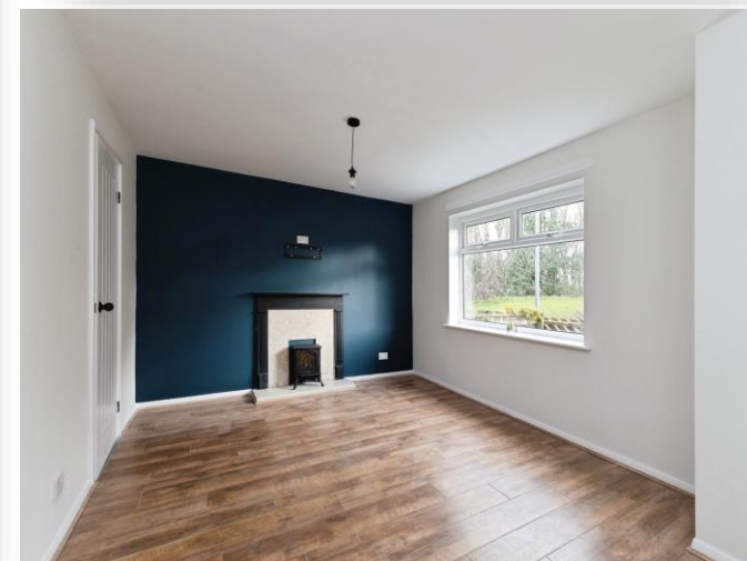
Coverdale, Hemlington Middlesbrough TS8 9SF