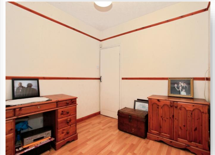
Scotney Street, Peterborough PE1 3NE