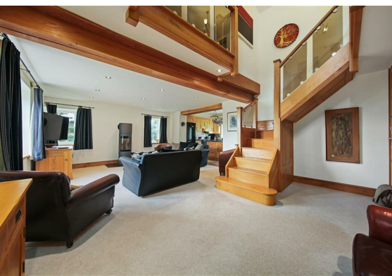
The Hayloft The Old Stables Planning Permission