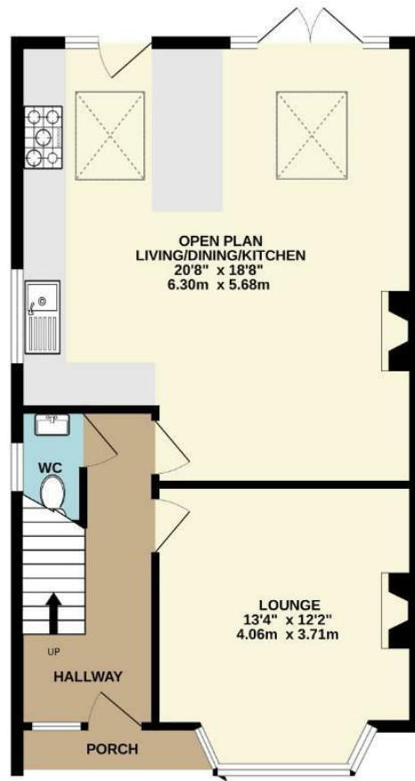
GROUND FLOOR 630 sq.ft. (58.5 sq.m.) approx.