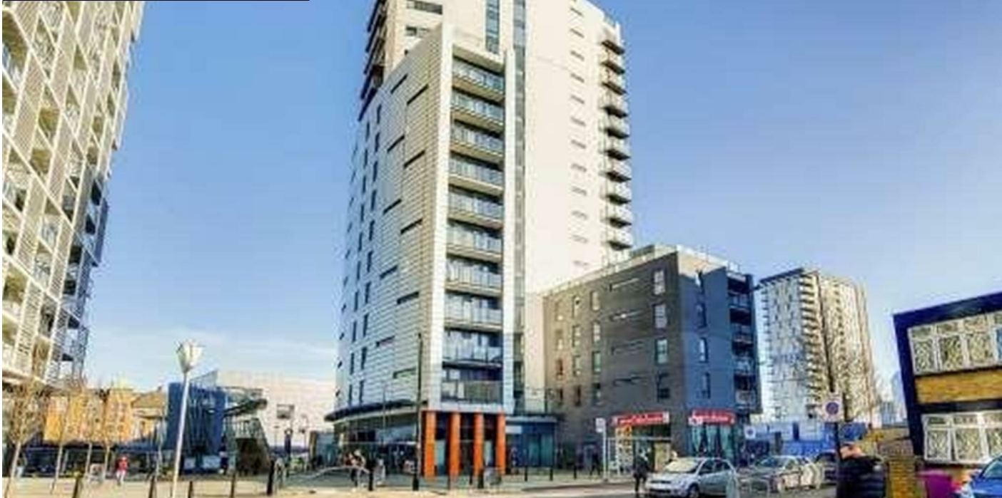
Crisp Street London E14 6ET