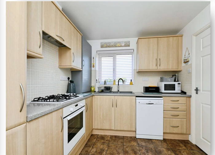
South Beach Road, Heacham, PE31 7BA