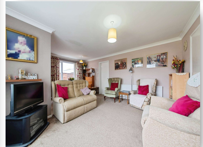
Hervey Road, Sleaford NG34 7LT