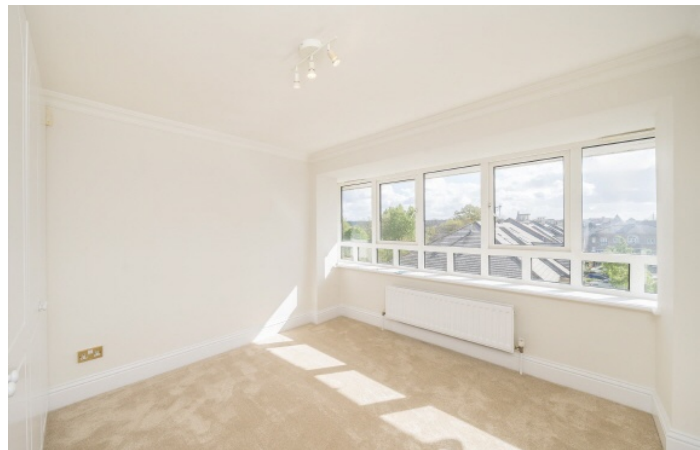
Samuel Gray Gardens, KT2