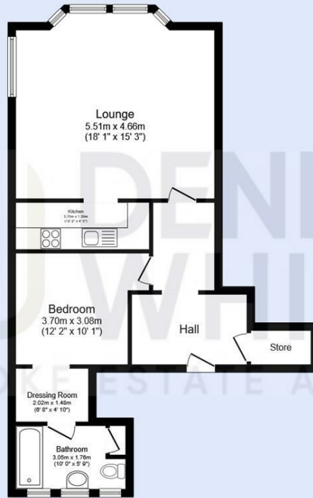
Floor Plan Floor area 64.5 sq.m. (694 sq.ft.)

Total floor area: 64.5 sq.m. (694 sq.ft.)