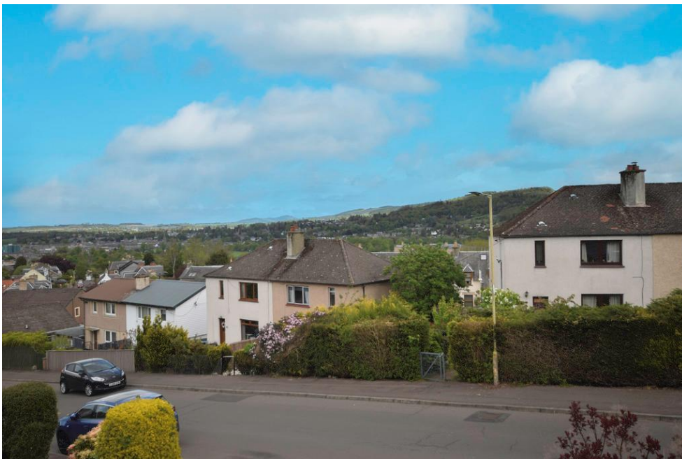
Next Home - 29 Glenlochay Road, Perth, PH2 0AX