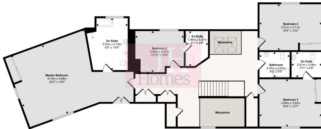
First Floor Approx 183 sq m / 1973 sq ft

This floorplan is only for illustrative purposes and is not to scale. Measurements of rooms, doors, windows, and any items are approximate and no responsibility is taken for any error, omission or mis-statement. Icons of items such as bathroom suites are representations only and may not look like the real items. Made with Make Snappy 360.