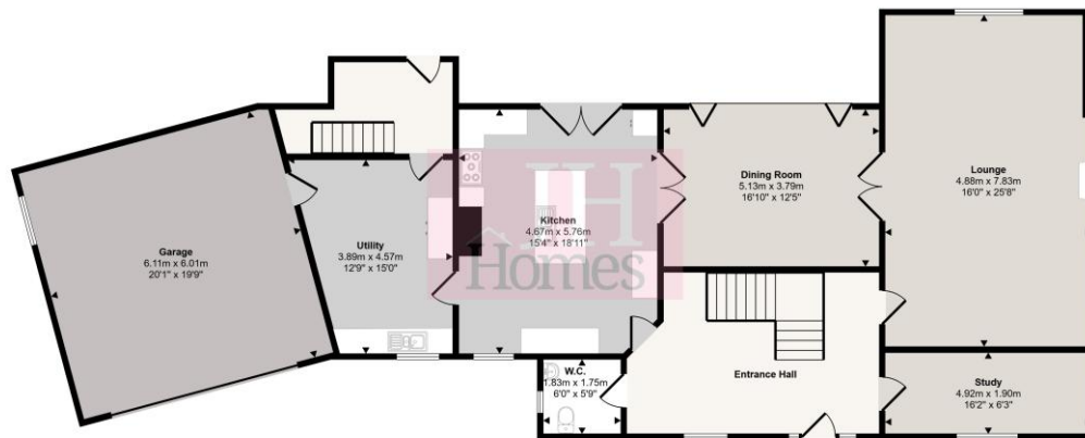
Ground Floor Approx 183 sq m / 1971 sq ft

This floorplan is only for illustrative purposes and is not to scale. Measurements of rooms, doors, windows, and any items are approximate and no responsibility is taken for any error, omission or mis-statement. Icons of items such as bathroom suites are representations only and may not look like the real items. Made with Make Snappy 360.