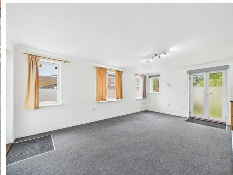
Flat 34 Peddle Court West End Road, High Wycombe, HP11 2AT