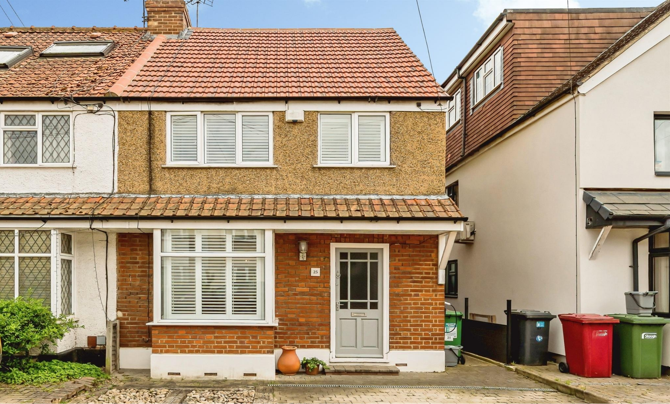
Westfield Road, Slough SL2 1HE