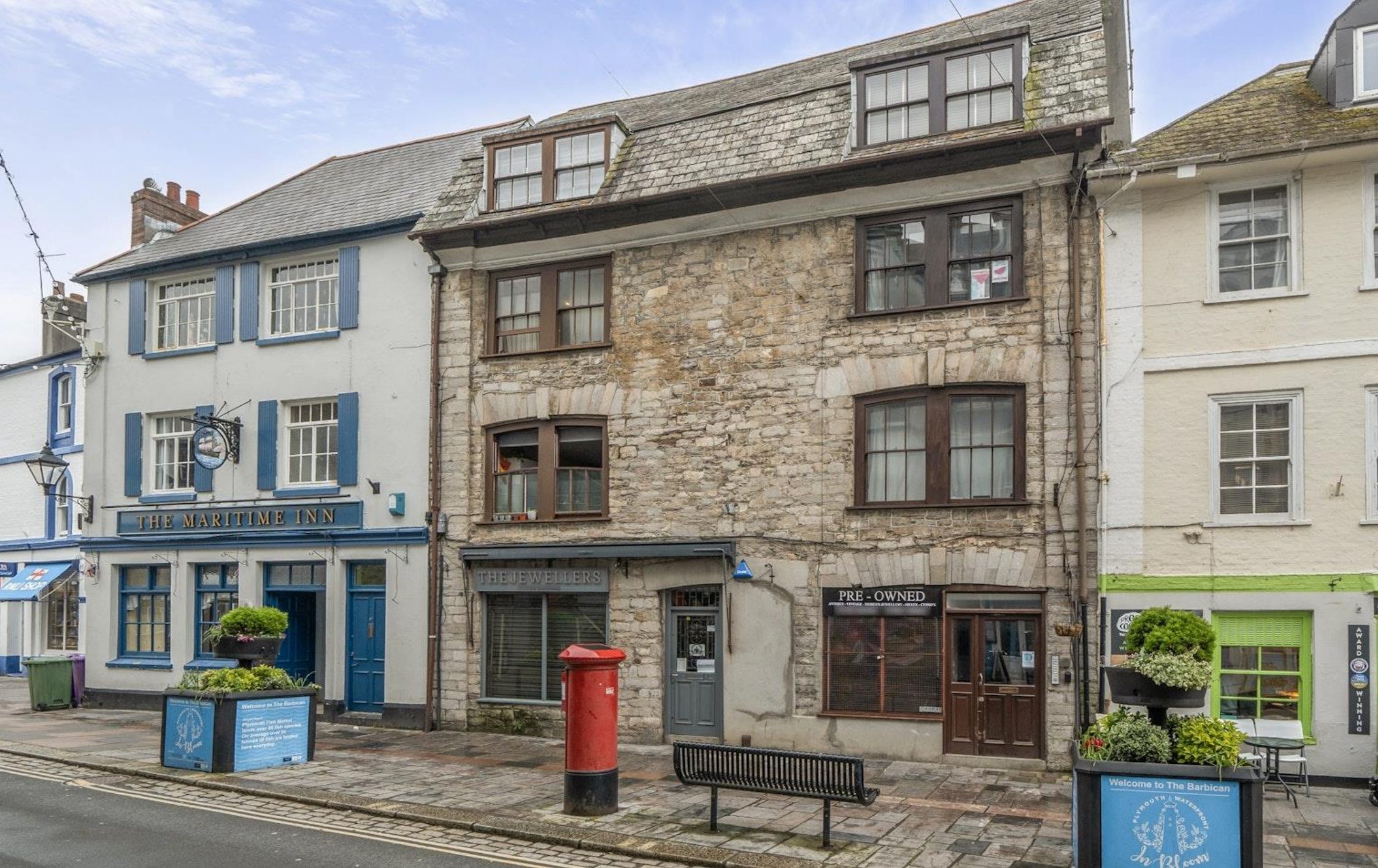
Southside Street, Barbican, Plymouth