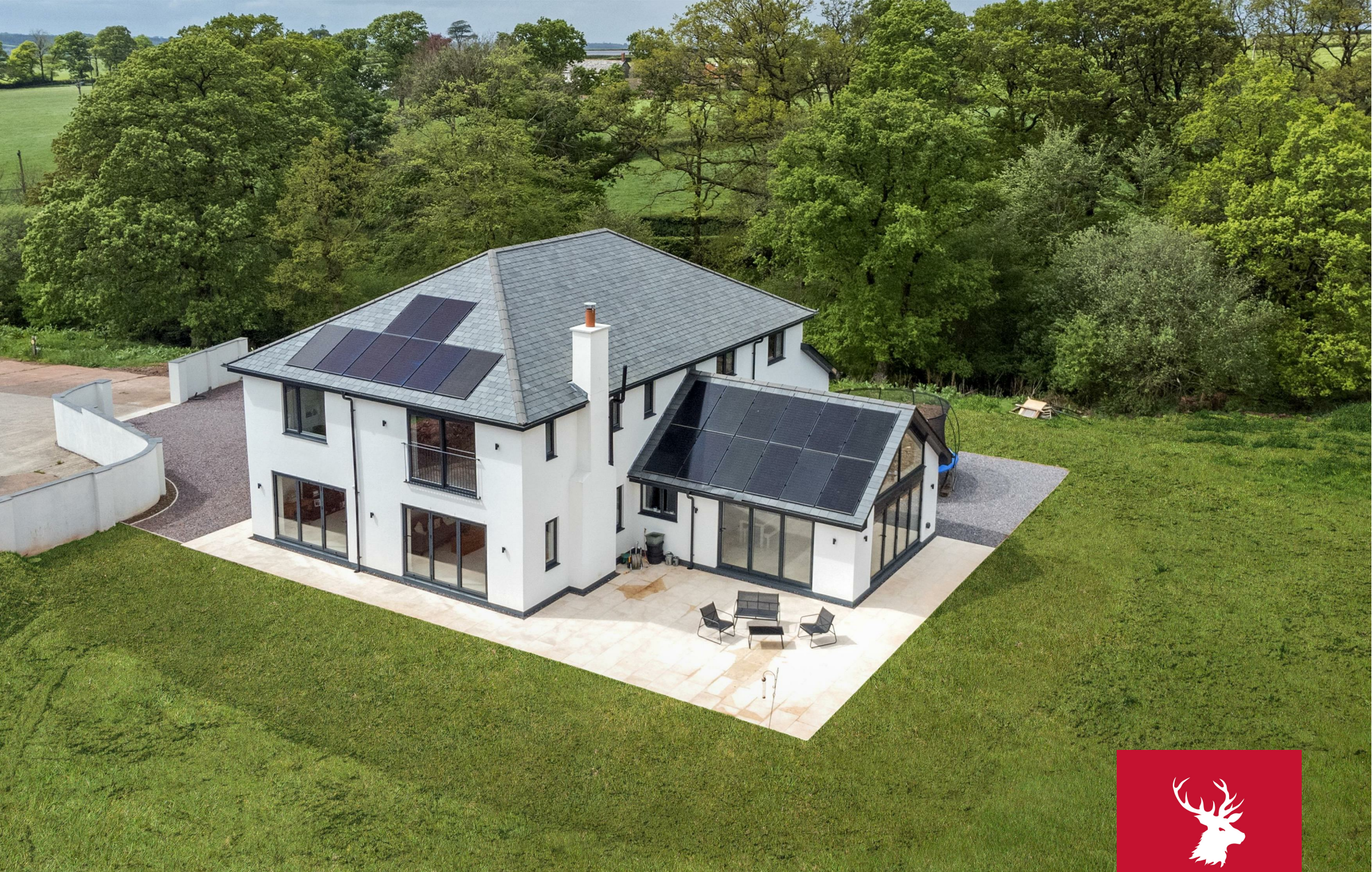
Two Moors Way House