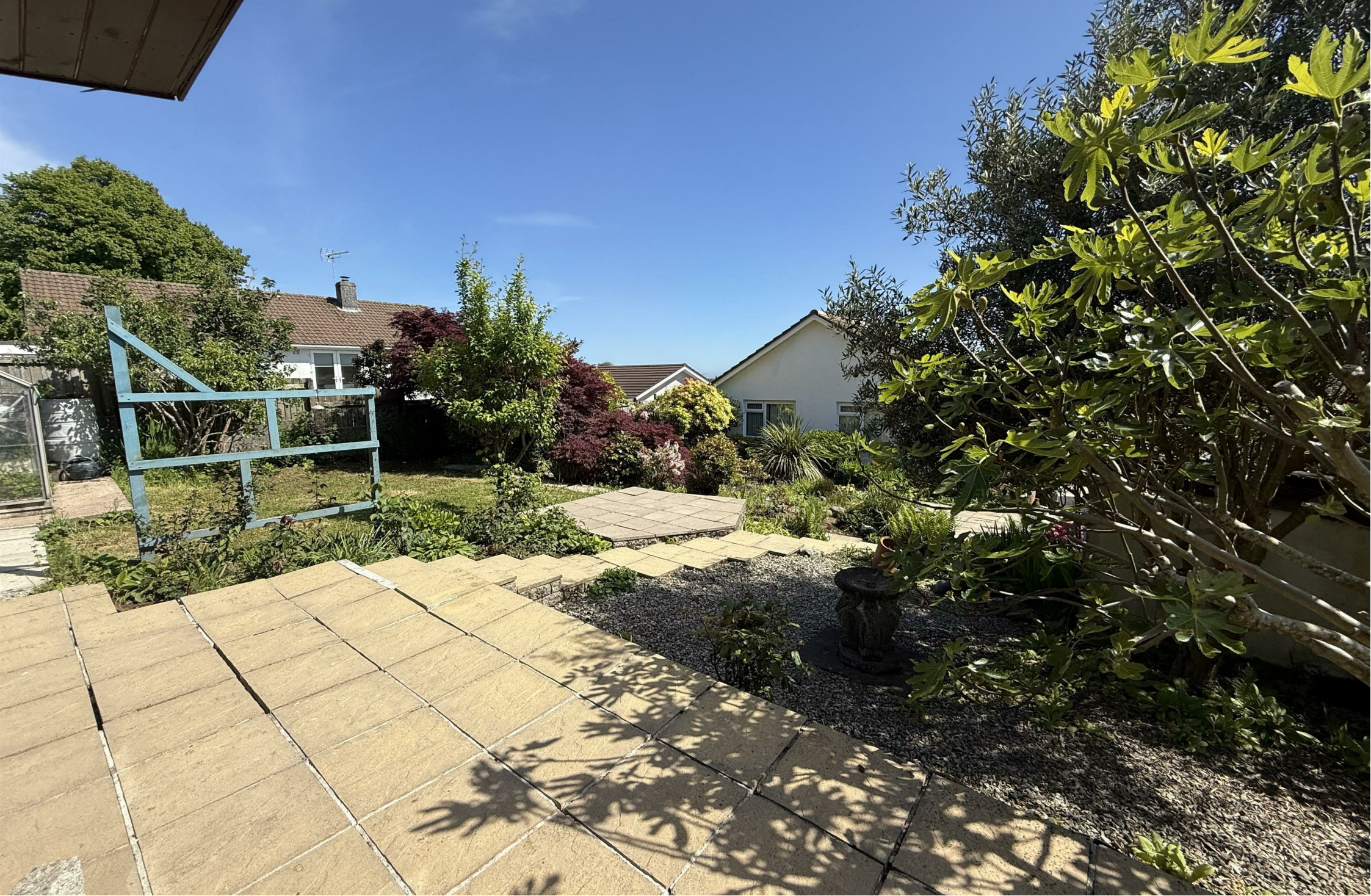
Menacuddle Lane, St. Austell, PL25 5QN