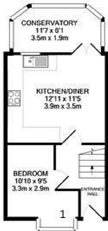
GROUND FLOOR APPROX. FLOOR AREA 344 SQ. FT. (31.9 SQ.M.)