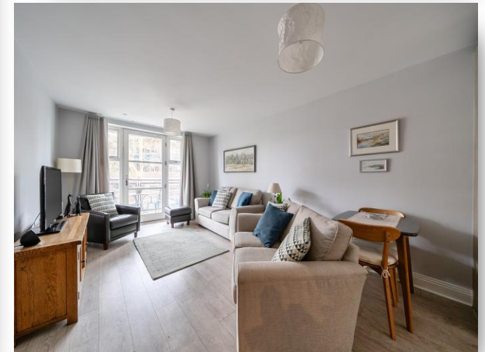
Apartment 16 Chapel Wharf, St. Ives Road, Maidenhead SL6 1QS