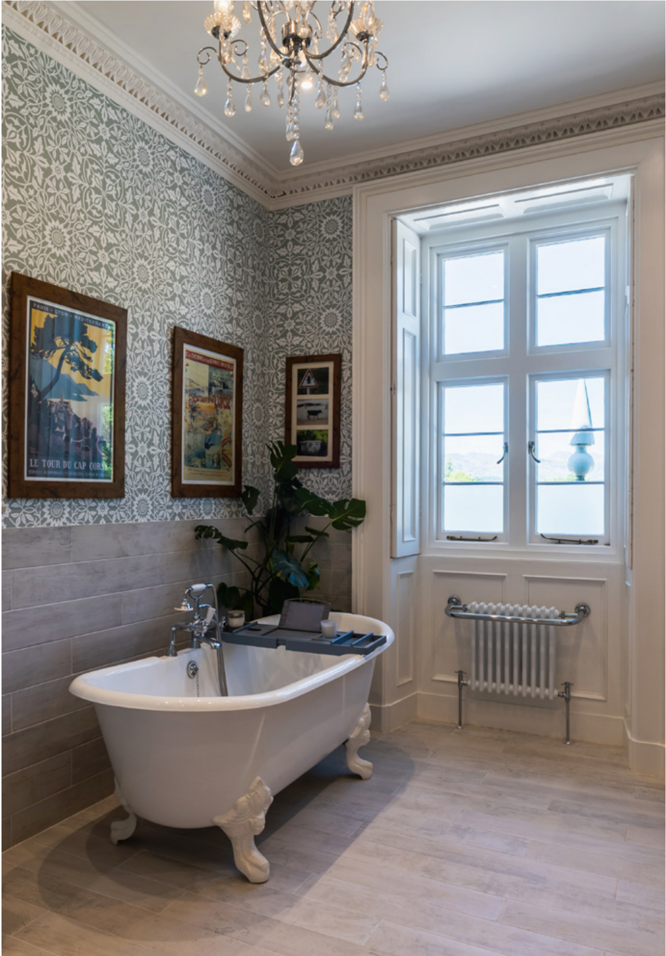
MASTER EN-SUITE BATHROOM