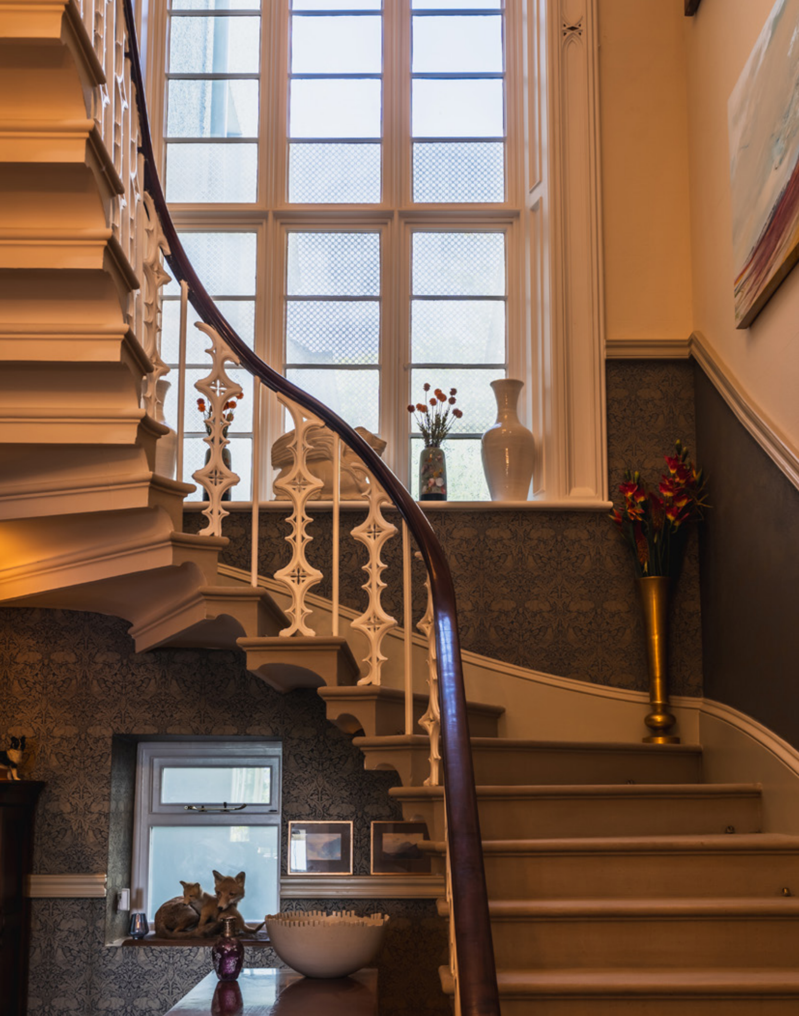
ENTRANCE HALL STAIRCASE

From the entrance hall, a curved sandstone staircase with a walnut hand rail and wrought iron balustrading rises to the first floor.