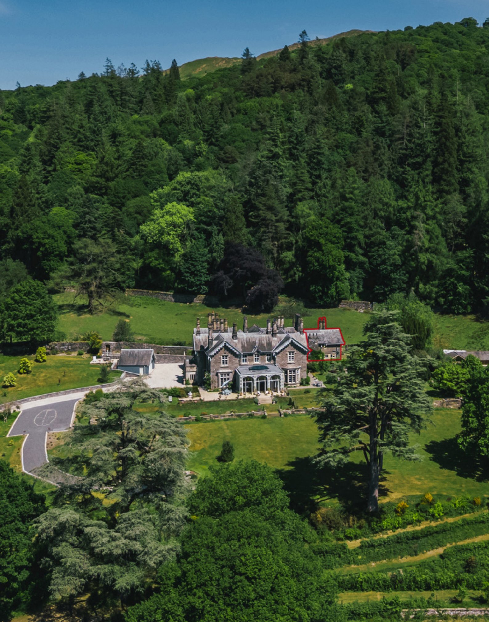
4 WANSFELL HOME NOT INCLUDED - OUTLINED IN RED

Having an up-and-over door, light, power and a personnel entrance door.