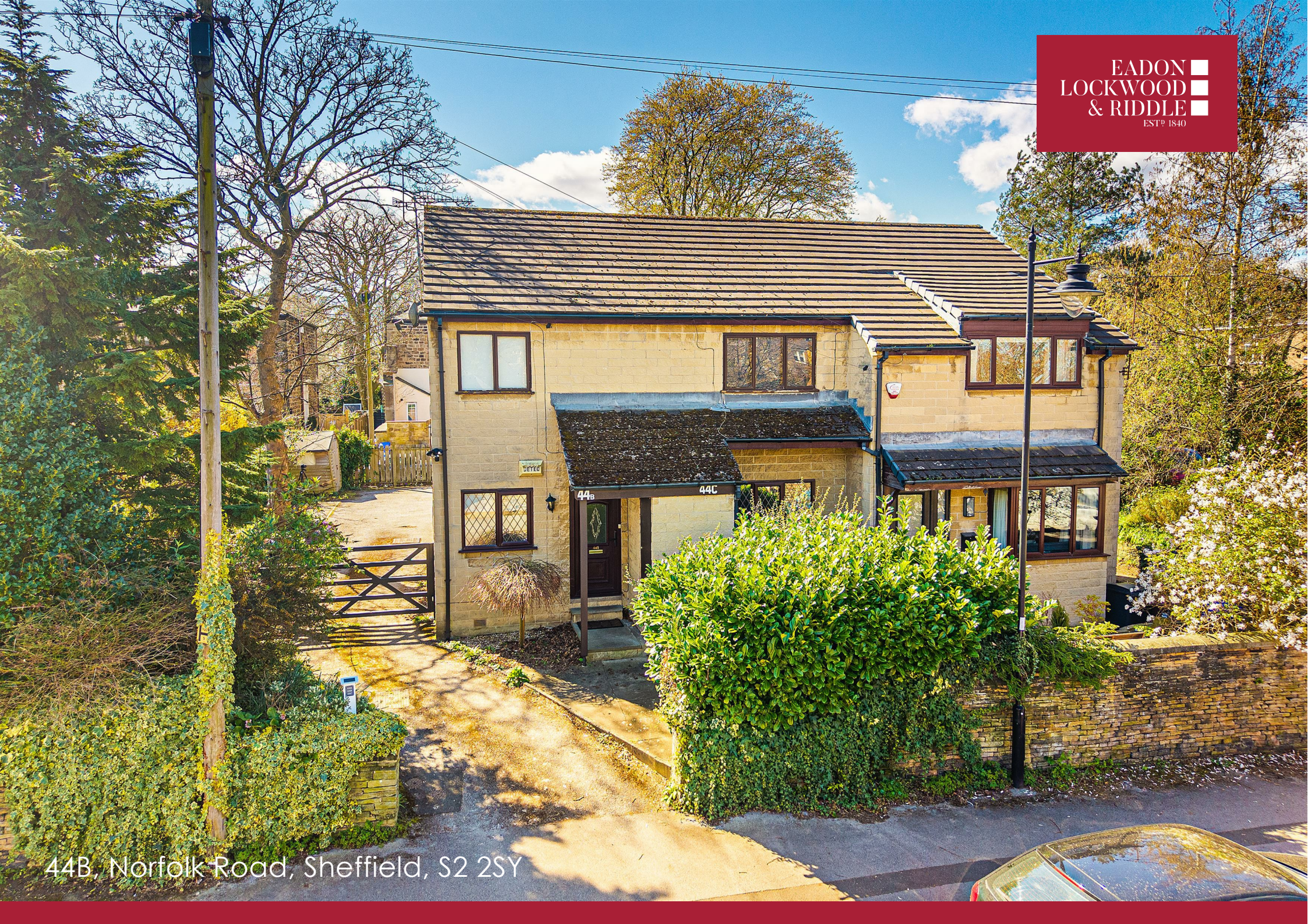
44B, Norfolk Road, Sheffield, S2 2SY