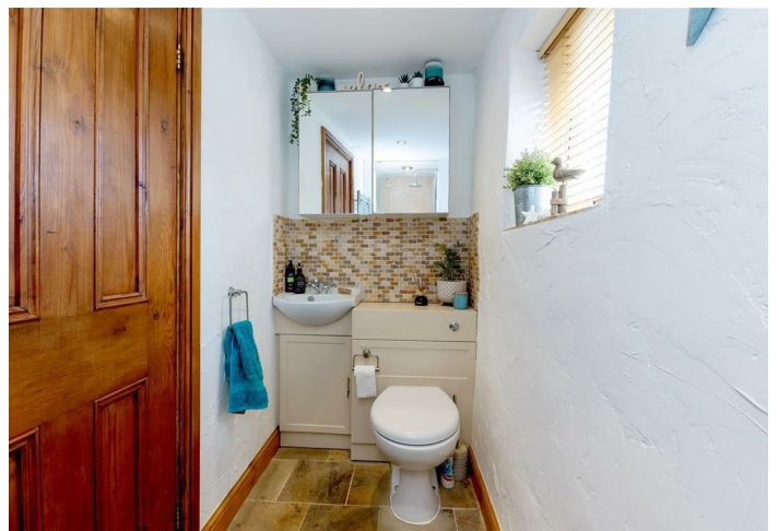
Ground Floor Shower Room