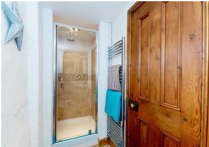
Ground Floor Shower Room