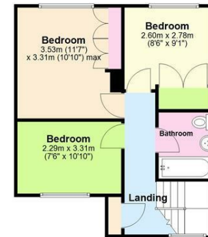
First Floor Approx. 40.9 sq. metres (440.6 sq. feet)