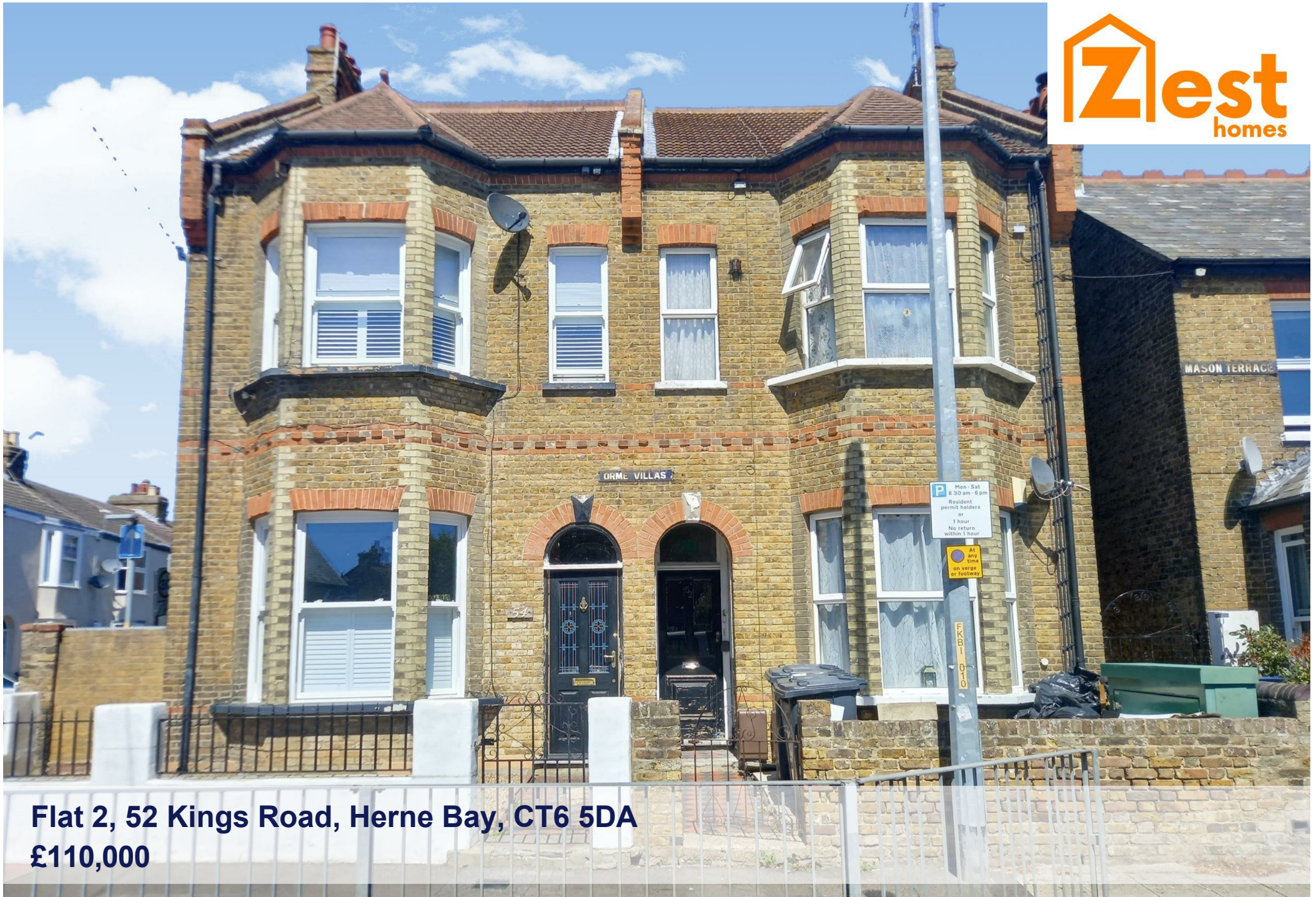
Flat 2, 52 Kings Road, Herne Bay, CT6 5DA £110,000