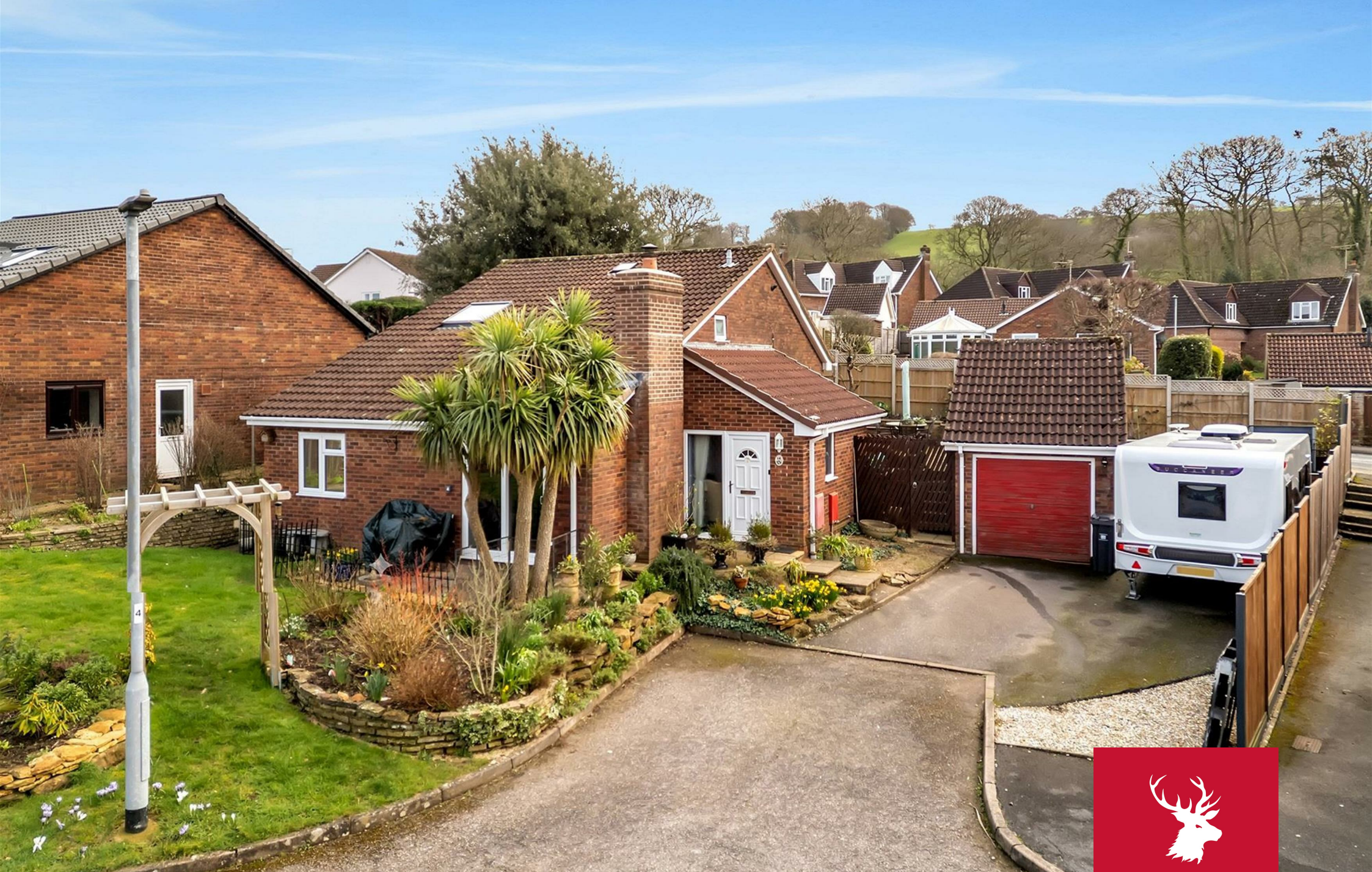
14 Bhutan Close