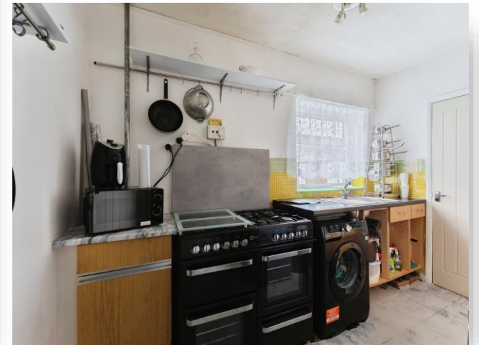
Bamburgh Court, Ellesmere Port CH65 9EL