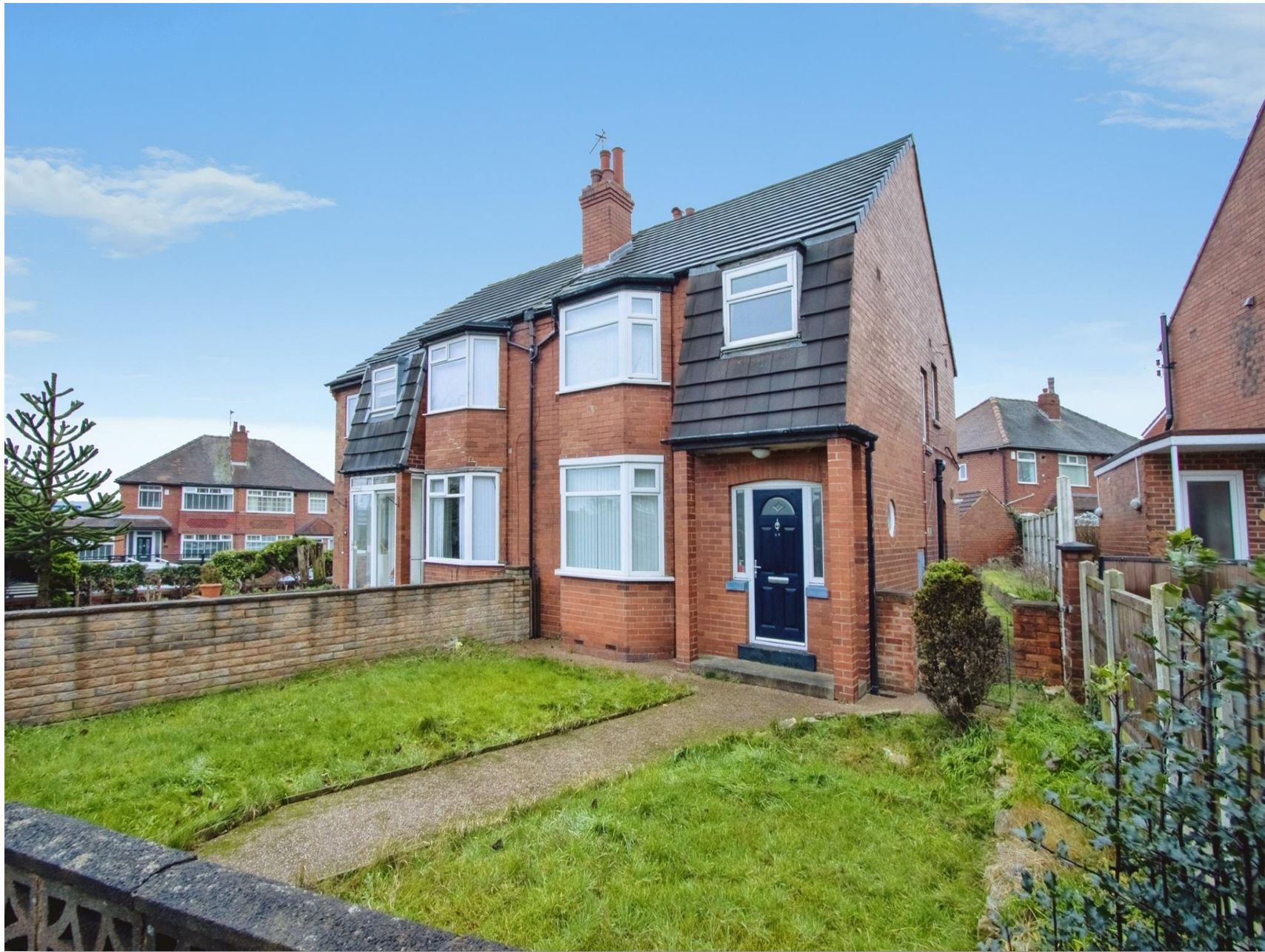
Ring Road, Crossgates Leeds LS15 7QB