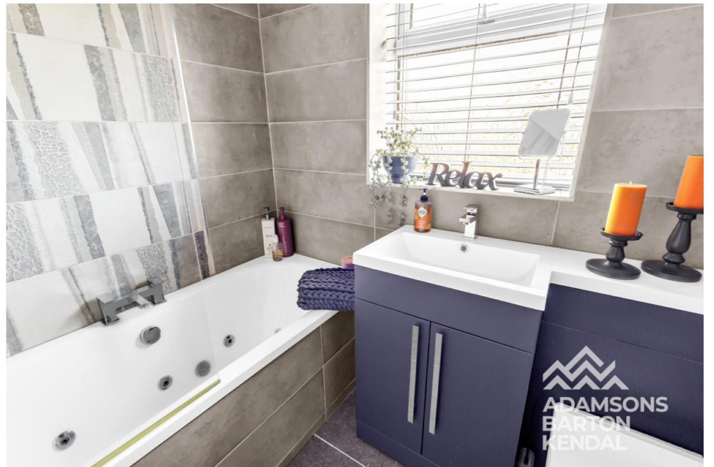
Watercroft, Norden OL11 5PH