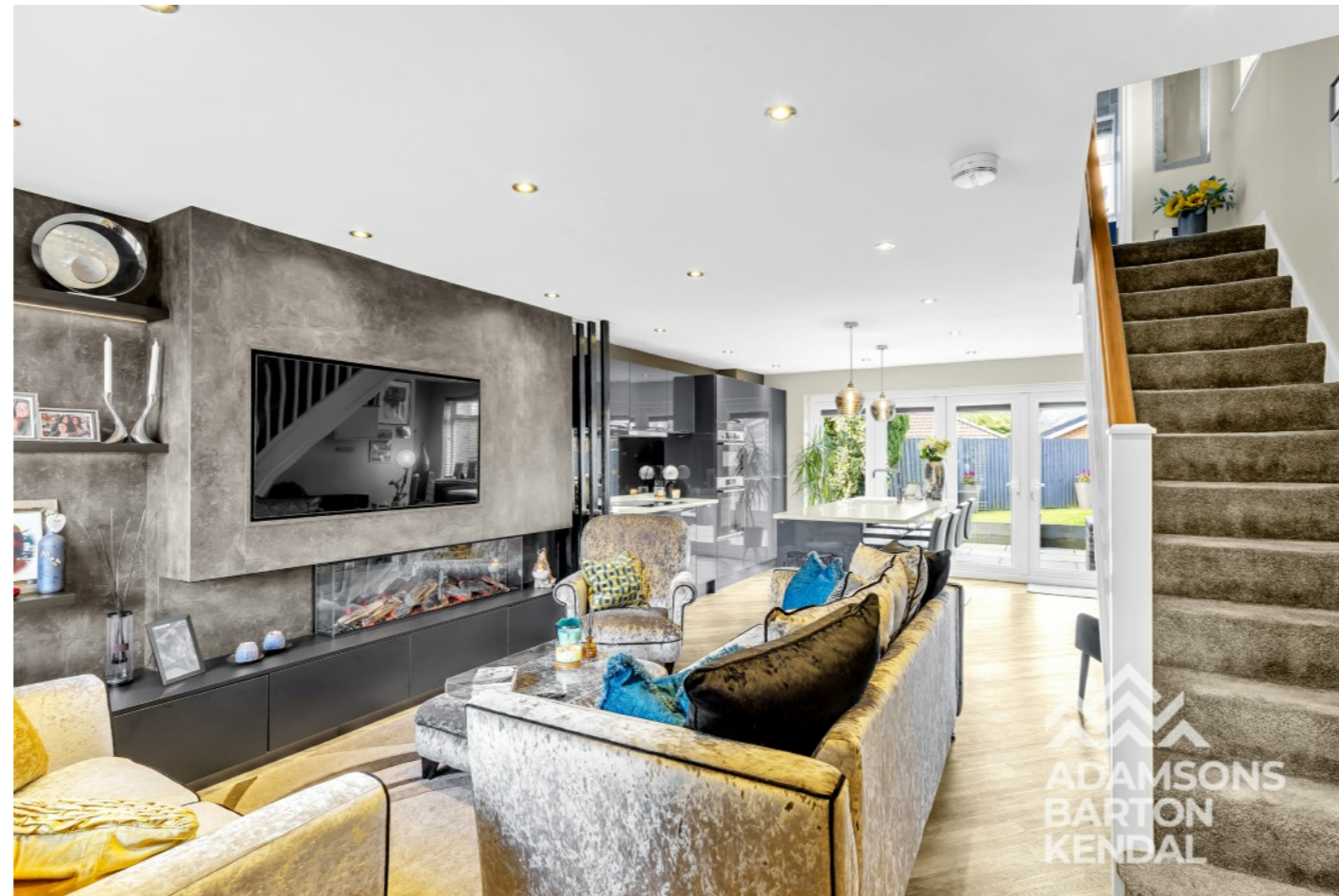
Watercroft, Norden OL11 5PH