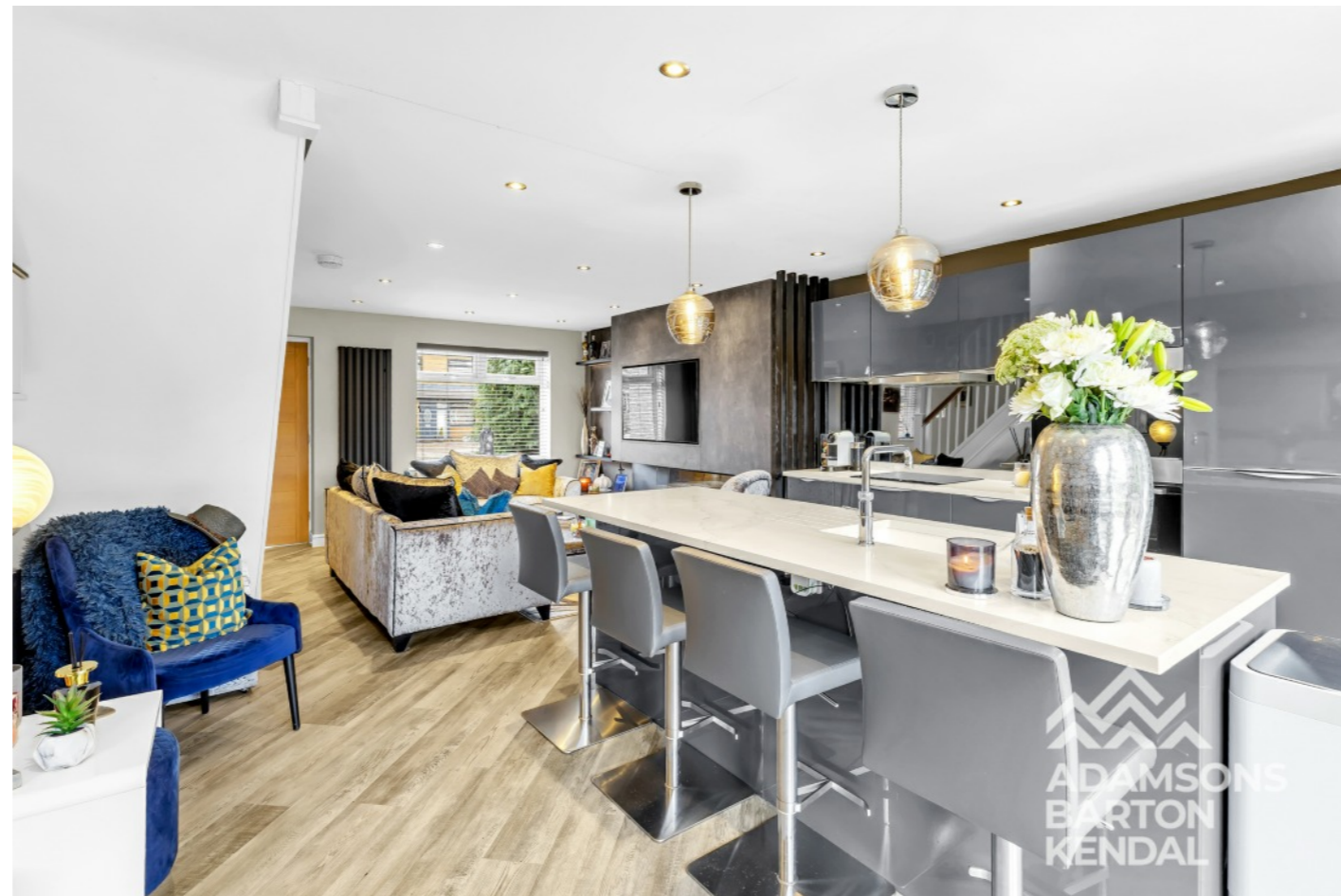
Watercroft, Norden OL11 5PH