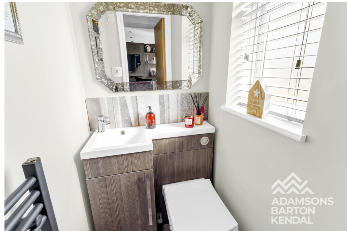
Watercroft, Norden OL11 5PH