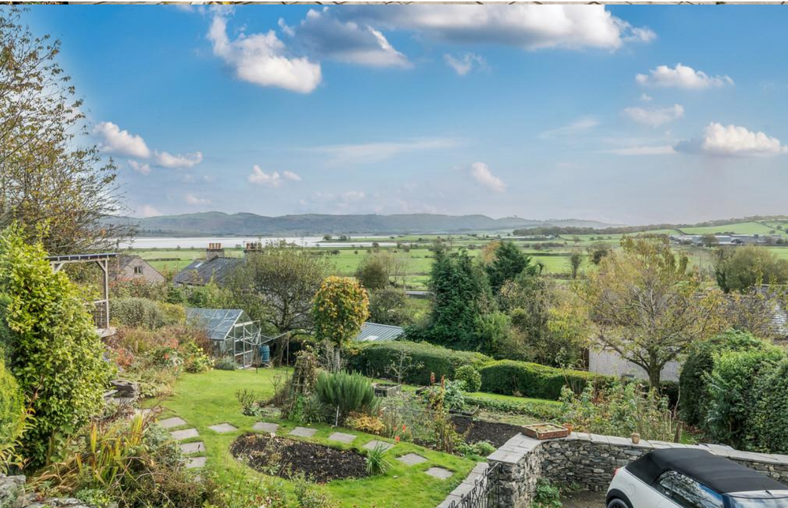
Garden at Sea View