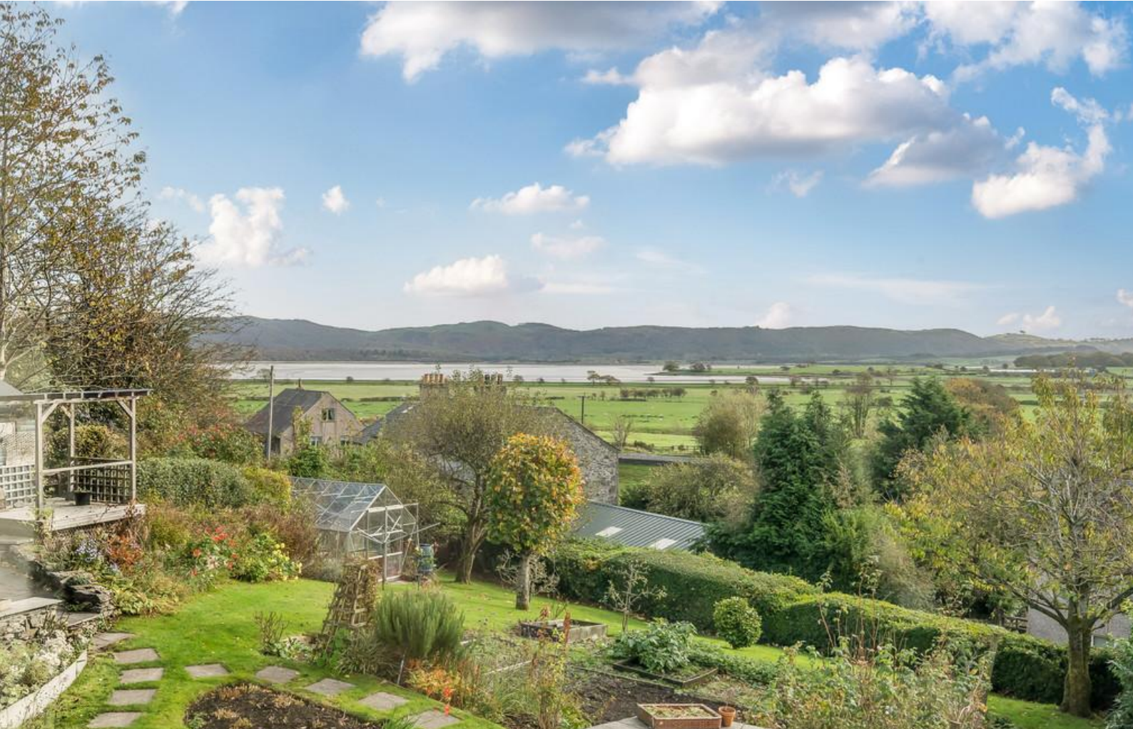
Garden at Sea View