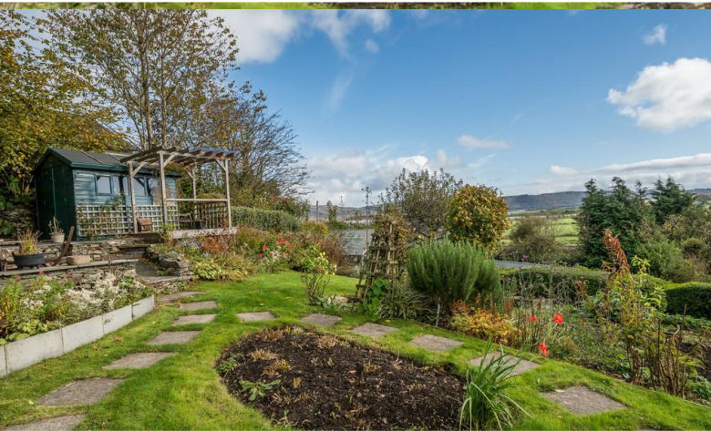
Garden at Sea View