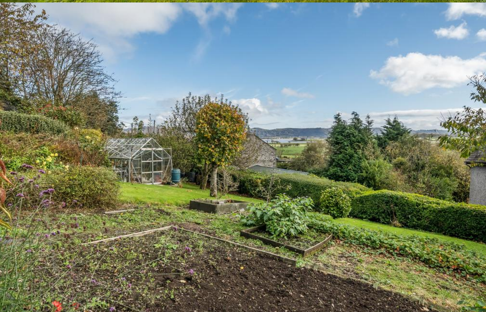
Garden at Sea View