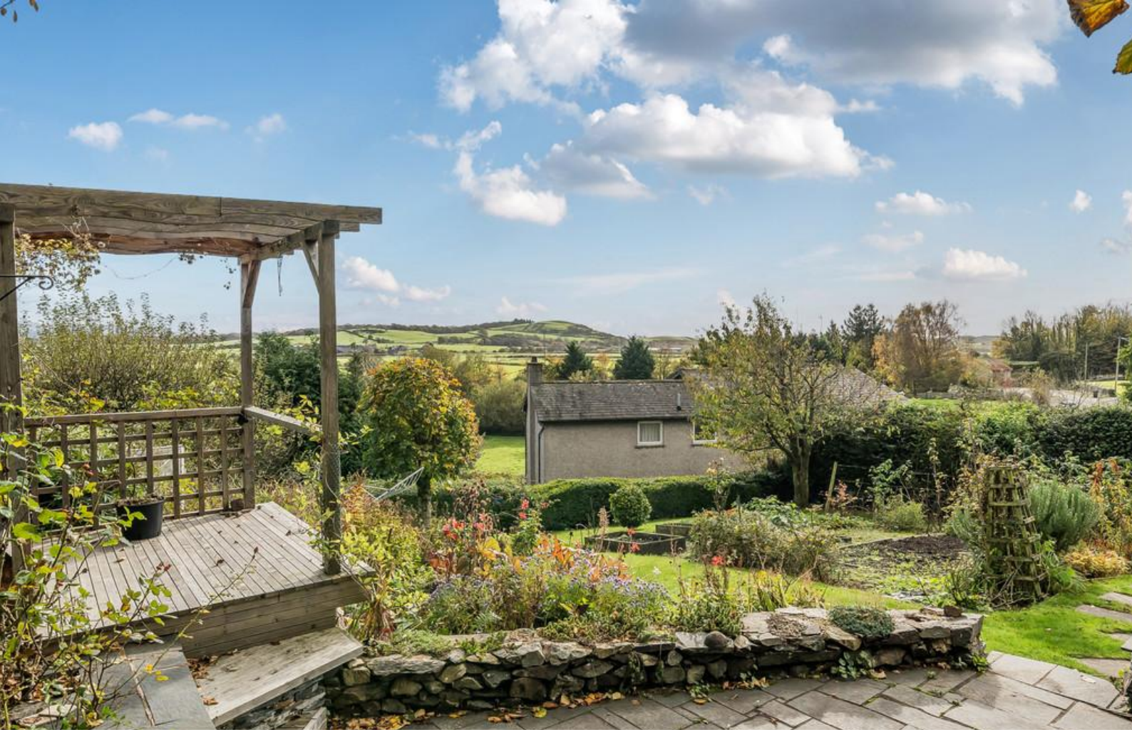
Sun Terrace at Sea View