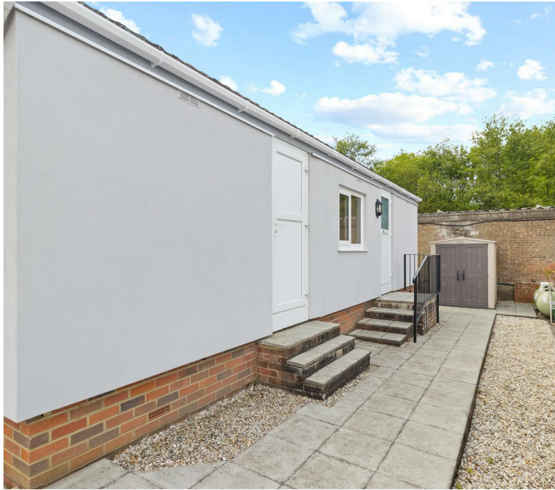
Bakers Farm, Upper Horsebridge