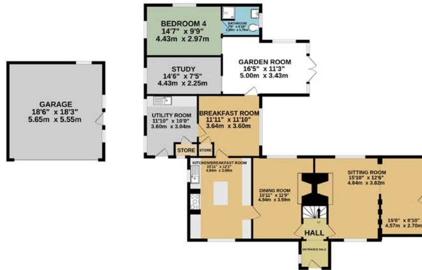
GROUND FLOOR 1755 sq.ft. (163.1 sq.m.) approx.