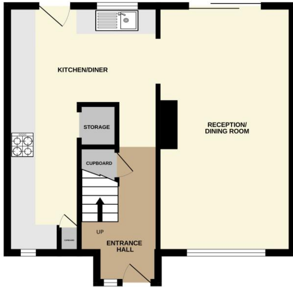
GROUND FLOOR 464 sq.ft. (43.2 sq.m.) approx.