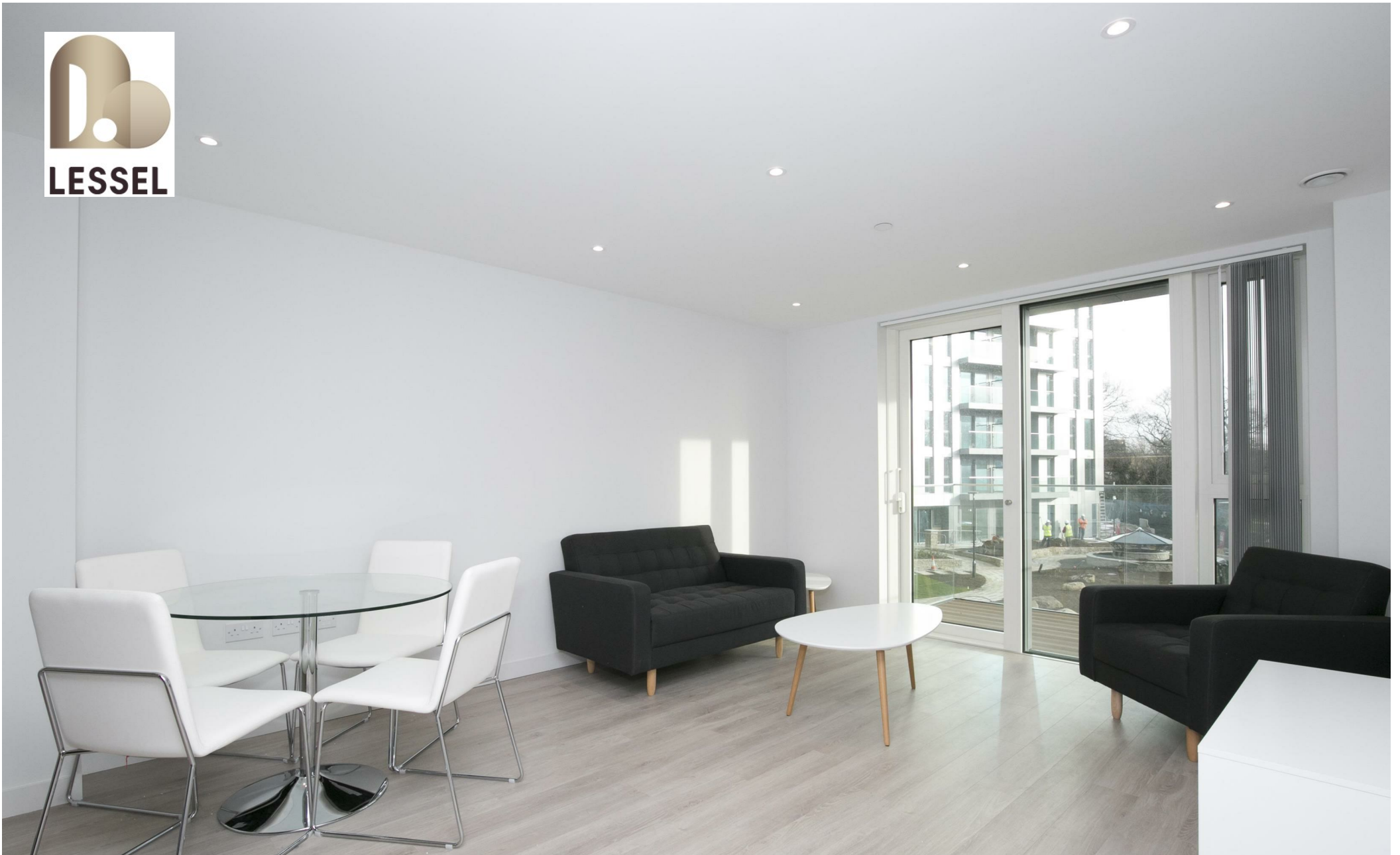
Flat 8 The shoreline Building Newnton Close, London, N4 2GT £530 Per Week