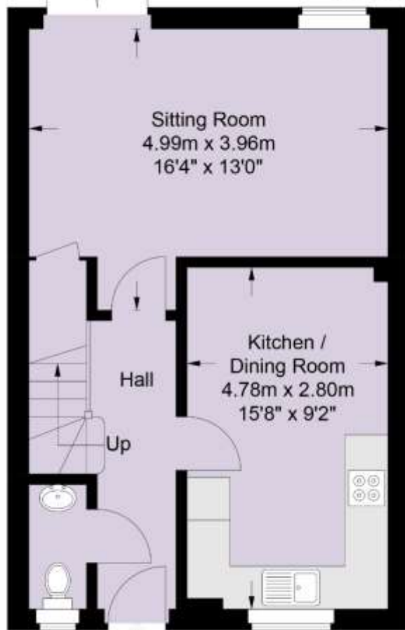
IN Ground Floor