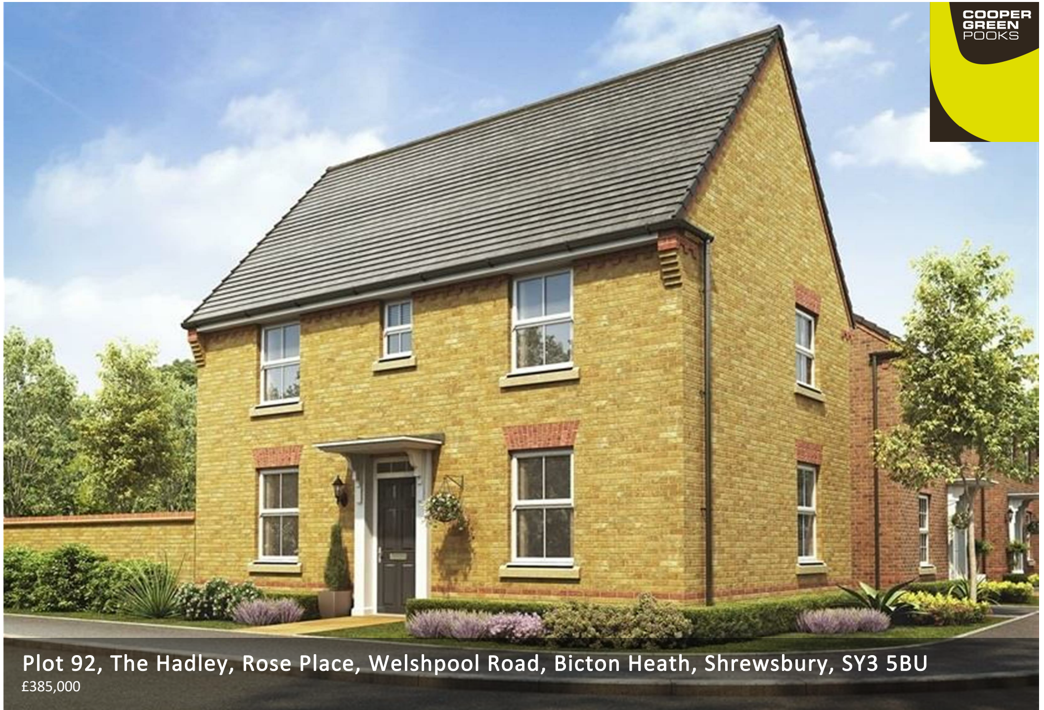
Plot 92, The Hadley, Rose Place, Welshpool Road, Bicton Heath, Shrewsbury, SY3 5BU £385,000