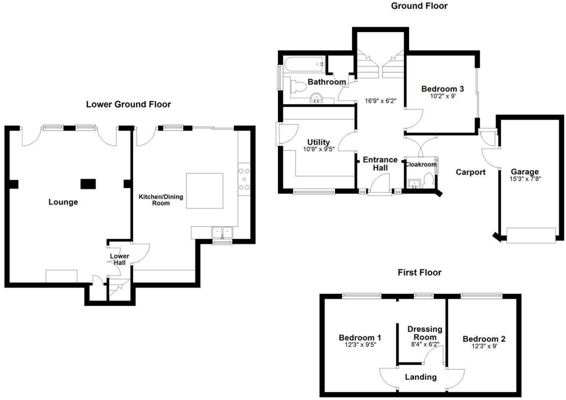
Total area: approx. 1540.5 sq. feet