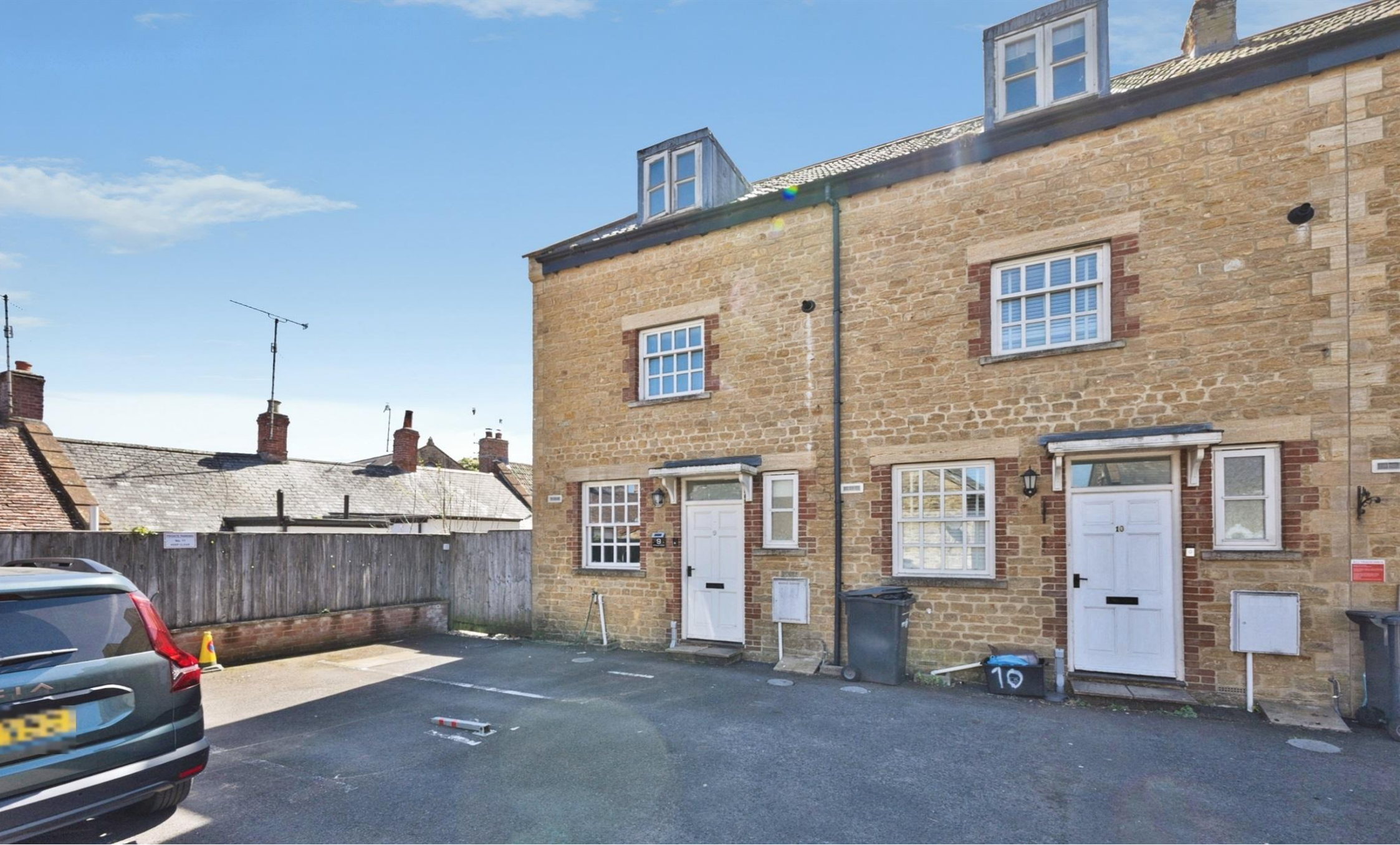
Madison Court, West Street, Crewkerne TA18 8EP