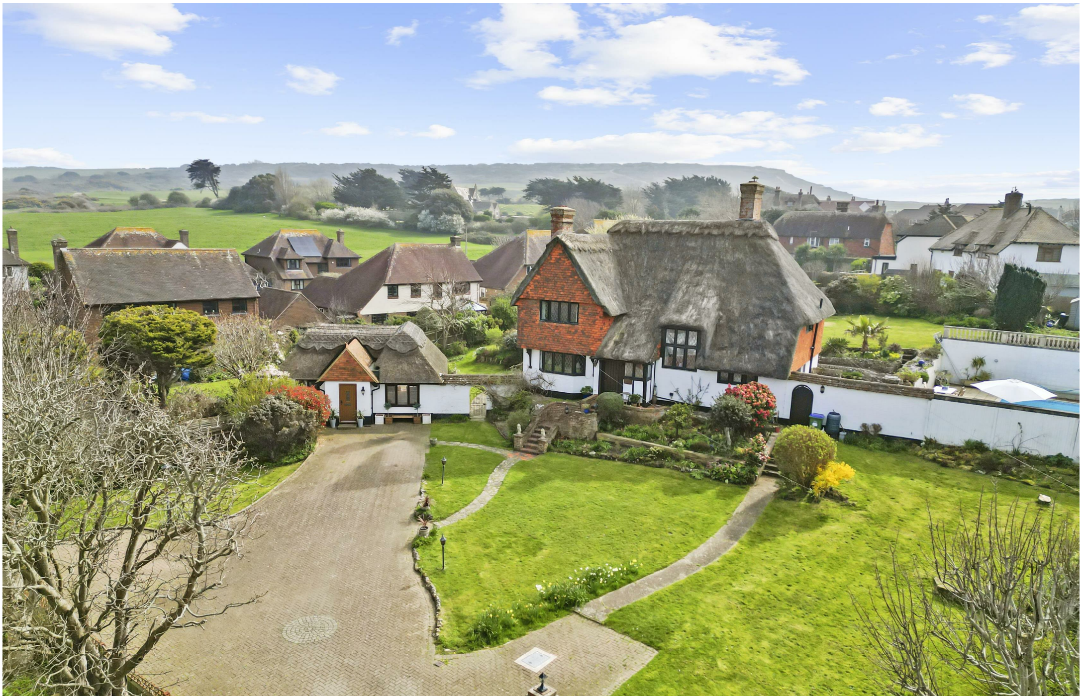
LION'S COTTAGE LIONS PLACE, SEAFORD, EAST SUSSEX, BN25 1AY