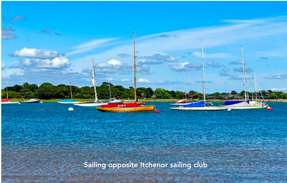
Sailing opposite Itchenor sailing club

Mariners is a stunning superbly appointed detached bungalow immaculately presented with spacious accommodation and contemporary features, comprising: 3 bedrooms, 2 bathrooms and a stunning kitchen/dining/sitting room, delightful landscaped gardens and grounds, and a detached home office, peacefully located in the heart of a highly sought after sailing village with amazing walks virtually emanating from the doorstep across stunning countryside leading to the harbour.