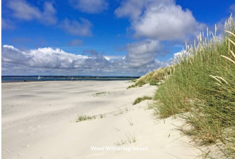
West Wittering beach