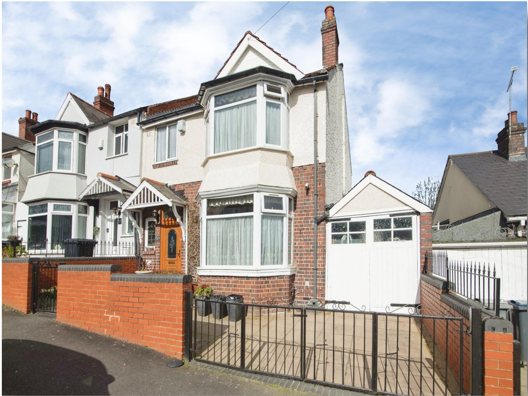
Grafton Road, Handsworth Birmingham B21 8PN