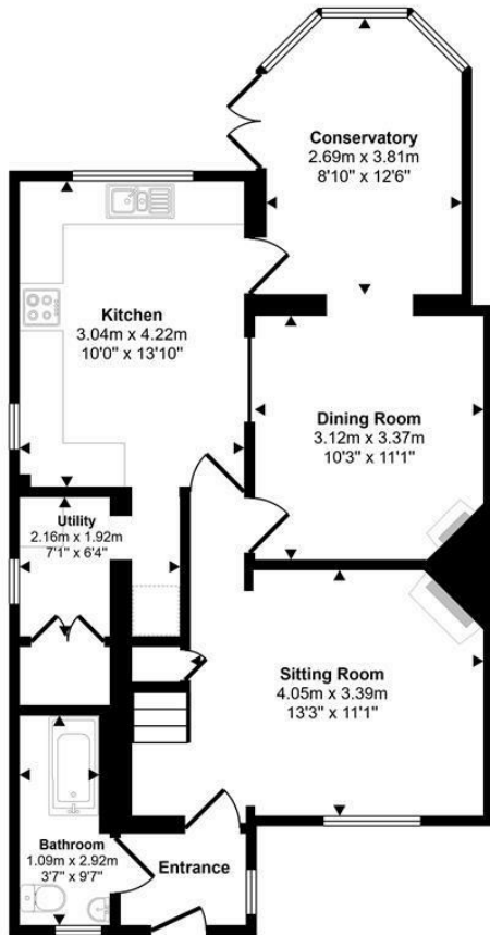
Ground Floor Approx 66 sq m / 708 sq ft

Approx Gross Internal Area 109 sq m / 1175 sq ft