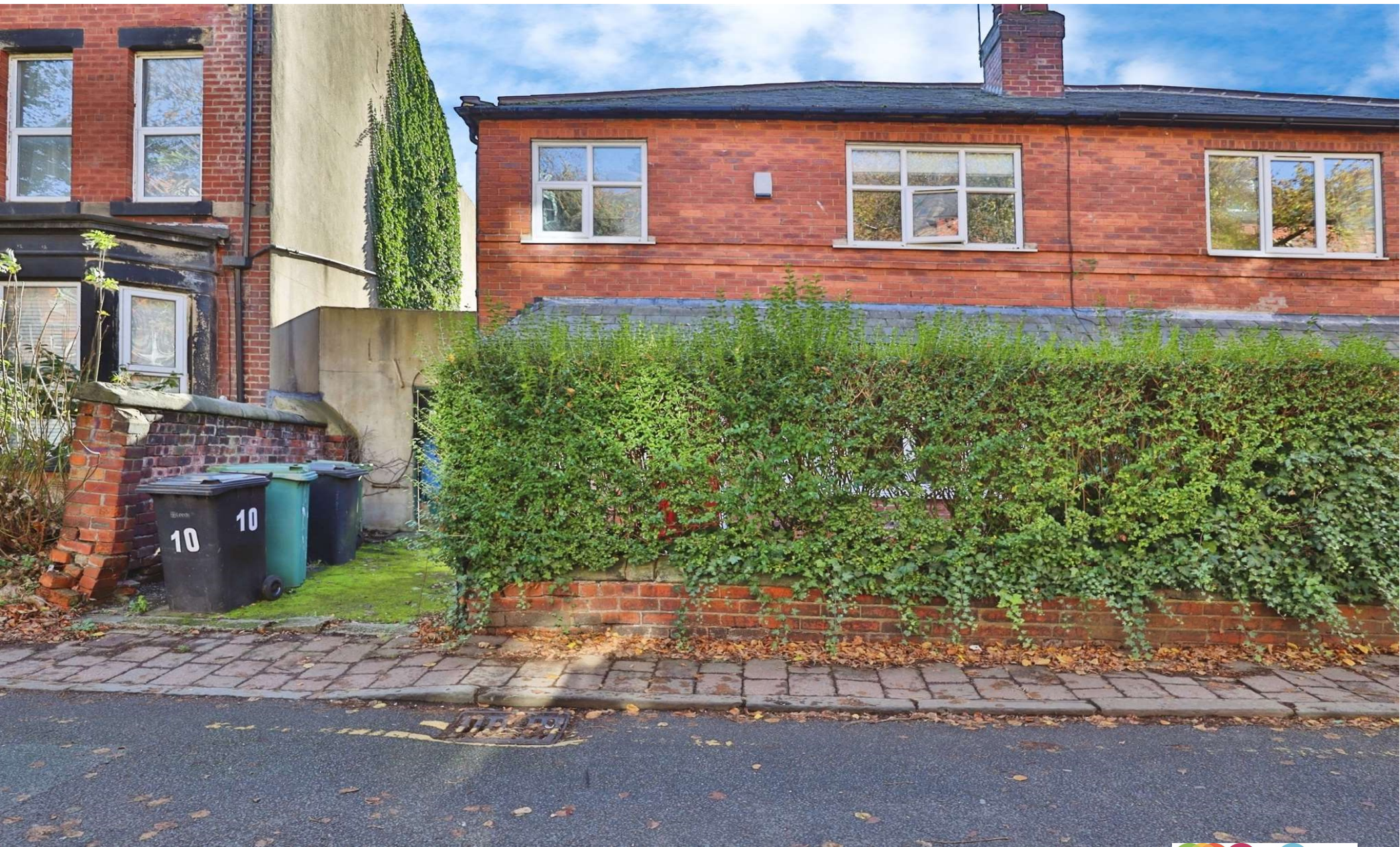
Regent Park Terrace, Leeds LS6 2AX