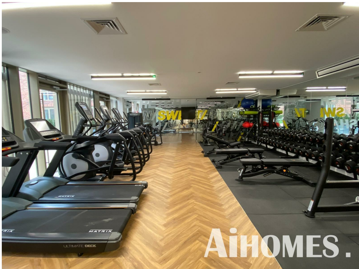
Modern 2B2B Apartment | Local Crescent | Salford M5 IB6580951 C