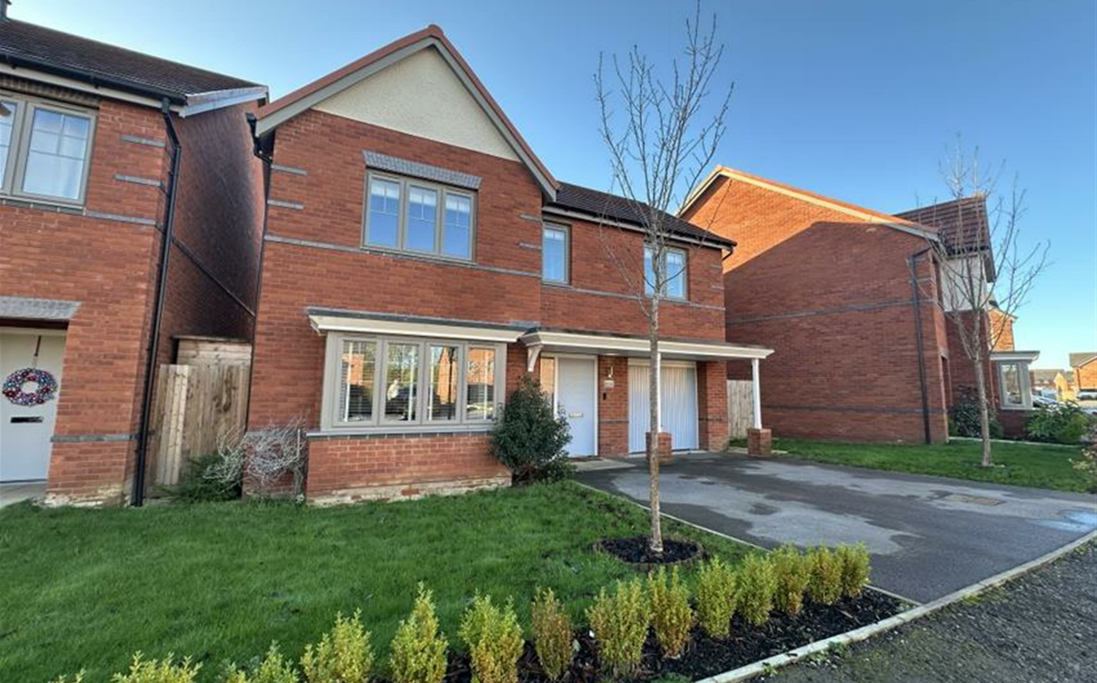
4 Sunstone Drive Swadlincote, DE11 0YD Reduced to £385,000