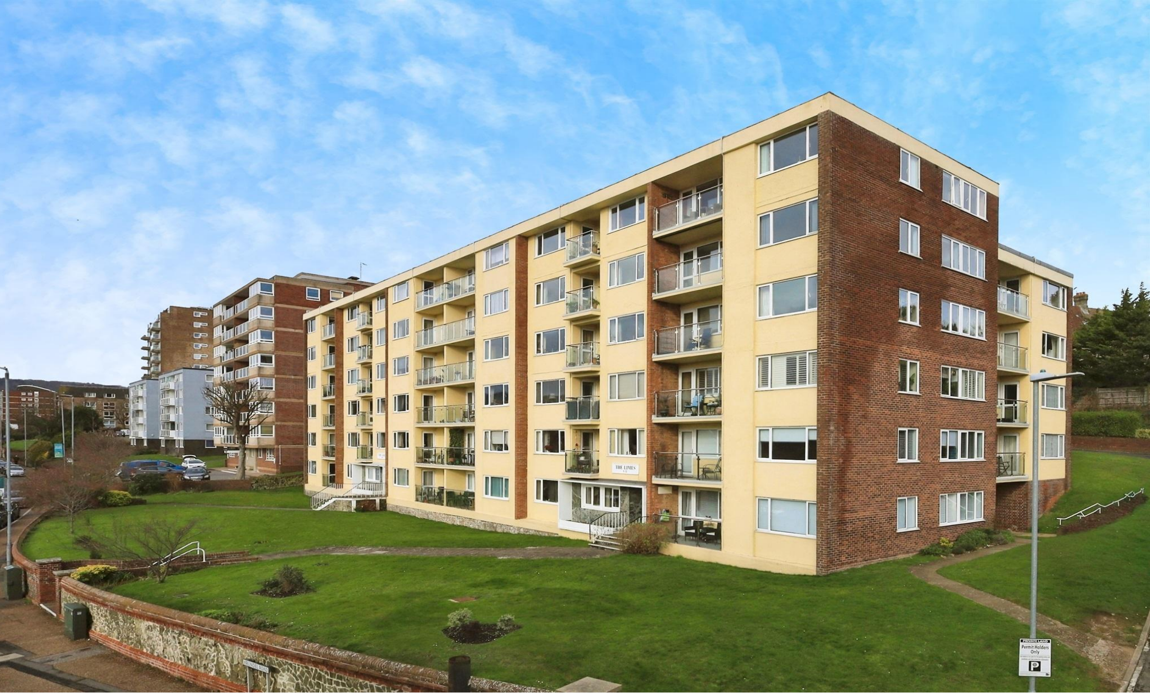
The Limes Upperton Road, Eastbourne BN21 1JT