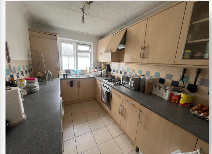
Kenton Court Northern Road, Aylesbury HP19 9QX