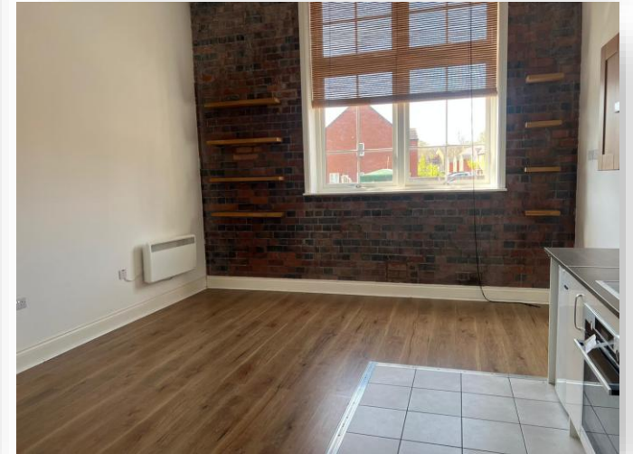
The Saddles Crocketts Lane, Smethwick B66 3DJ