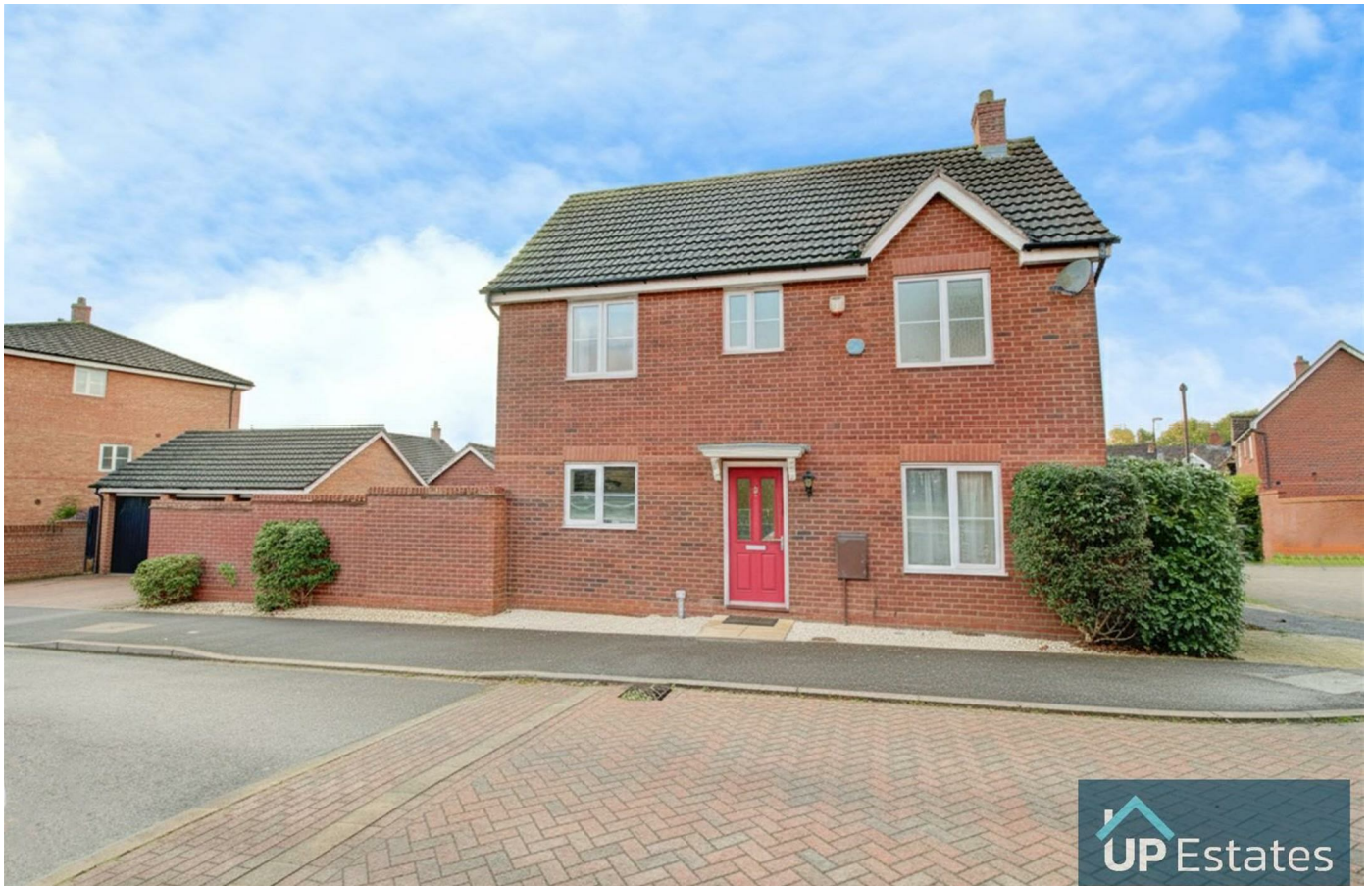
Shropshire Drive, Coventry